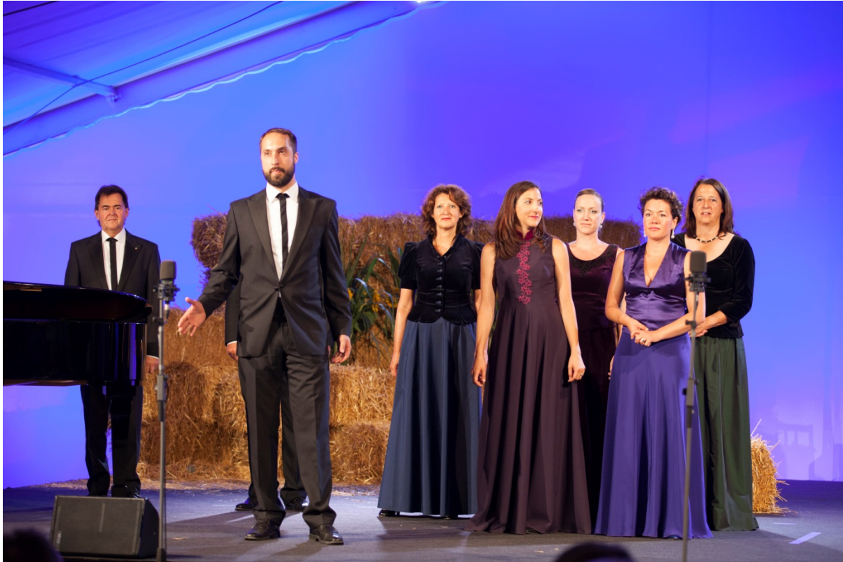
Compagnia Rossini has often delighted EMS shareholders at earlier Annual General Meetings.