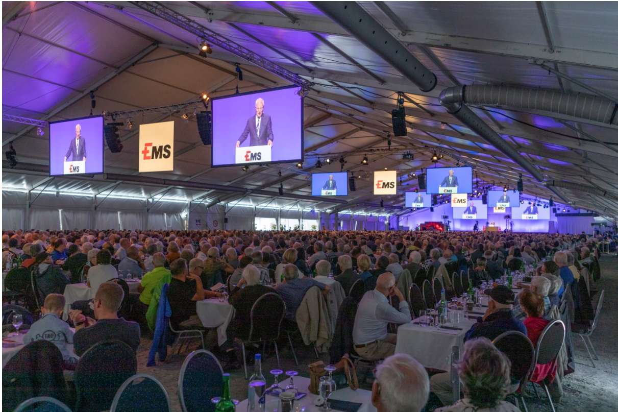
Annual General Meeting of the EMS-CHEMIE HOLDING AG 2019. On August 7, 2021 this major event will take place again in the marquee at the production site in Domat/Ems (GR).